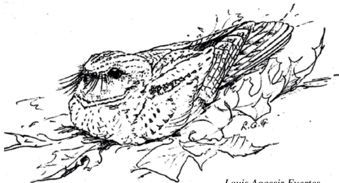
Louis Agassiz Fuertes